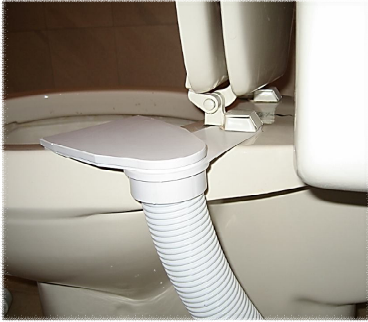
Sniffer installed using flexible hose

Durable ABS plastic Designed for easy cleaning Fits 1 1/2" ABS, 2" vacuum pipe and 2" flexible hose