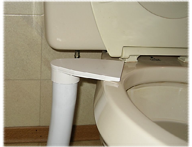
Sniffer installed using rigid pipe