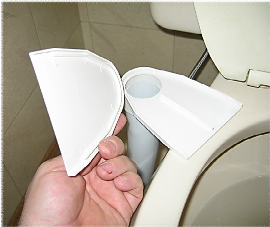
Can easily be taken apart for cleaning